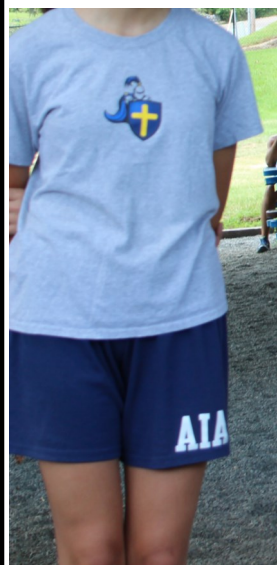
Middle School PE